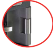
Anti-friction roller keeper