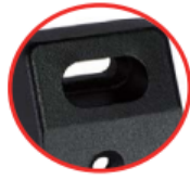
Horizontal adjustment holes